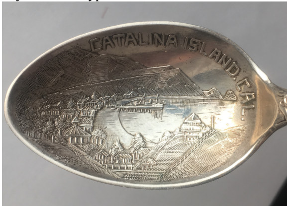
Paye & Baker Type 1

Notable for its detailed engraving-like appearance. Displays the early original Sugarloaf Point configuration. Hotel Metropole is shown without distinctive detail.